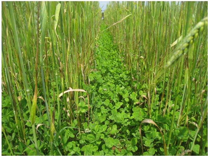
Fig. 2 Intercropping of organic wheat and white clover in southeastern France

roughage, fresh or dried fodder, or silage. Agroecology gives priority to feed (e.g. fresh grass, hay, silage) compared to food (e.g. cereal, pulses).