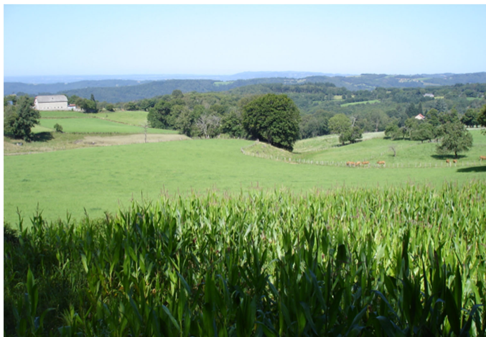
Fig. 1 Connecting livestock production, cropping and forestry with an agroecological approach, western France

Currently, agroecological farming is not market-driven: no certification systems nor labels exist so far for the produce, it